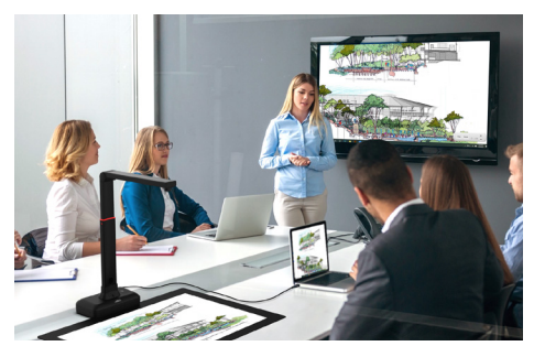
Remote Collaboration Ready The S21 is UVC/UAC compliant device, you can use it to project your works by using the 3rd video conferencing software during a remote meeting.

The embedded Optical Character Recognition (OCR) function allows you to convert scanned images into searchable PDF and editable Word, Excel and Text formats, it supports more than 130 different languages.