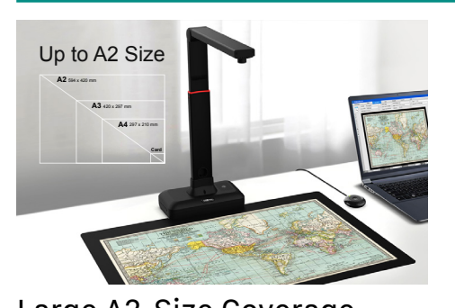
Large A2-Size Coverage Scan anything up to A2 in size. Especially for scan large format documents such as newspapers, maps, periodicals, and thick books.